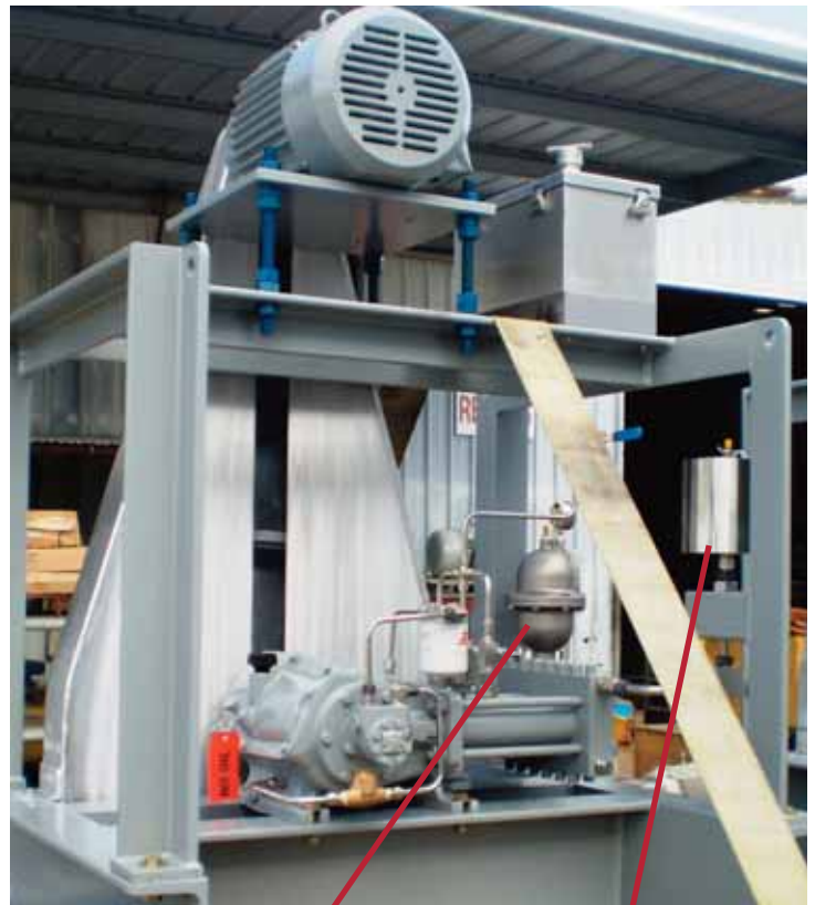
SENTRY Inlet Stabilizer

SOLUTION: A 12 cubic inch 10,000 psi SENTRY XPX model pulsation dampener was installed at the pump discharge to smooth out the flow and remove any pressure pulsations, thus allowing the dosing to be more accurate. An 85 cubic inch SENTRY inlet stabilizer (suction dampener) was installed on the inlet side of the pump to act as an accumulator to keep the pump chambers filled. The inlet stabilizer dampener also removes pulsations created by the pump on its inlet stroke.